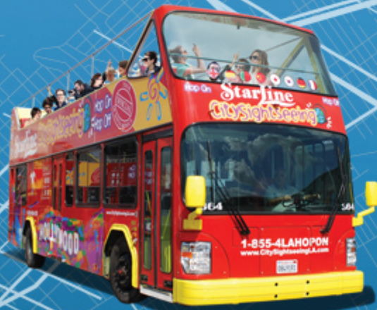
Double Decker Open-Top Bus