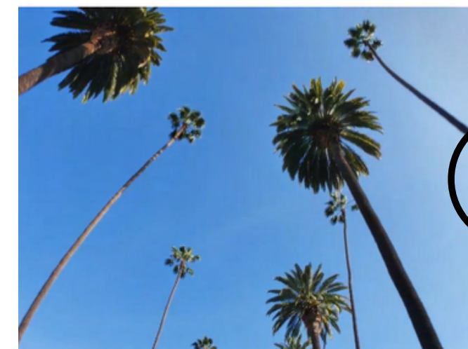
ANNA STAVARIDIS MERAKI FITNESS

For more information, samples and specifications, visit this link.