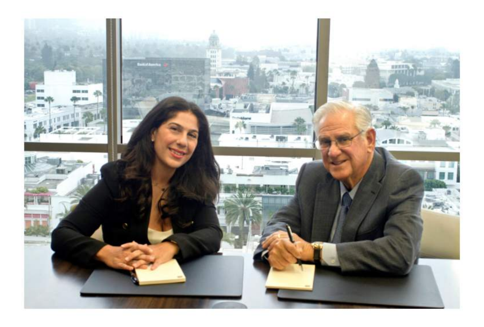
The Law Offices of