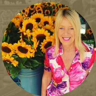
MAYOR LILI BOSSE CITY OF BEVERLYHILLS

THE BUSINESSES AND GREATER COMMUNITY OF BEVERLY HILLS GATHER FOR AN INTIMATE EVENING INCLUSIVE OF A WINE AND HORS D'OEUVRES RECEPTION ON THE GROUNDS OF GREYSTONE, FOLLOWED BY THE MAYOR'S FORMAL ADDRESS. AN EVENING WITH THE MAYOR IS AN ILLUMINATING AND DYNAMIC EVENING RICH IN CONVERSATION AND NETWORKING, MAKING THIS INTERACTIVE EXCHANGE BETWEEN BUSINESS AND GOVERNMENT ONE OF THE YEAR'S MOST INFORMATIVE EVENTS.