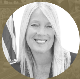
MAYOR LILI BOSSE CITY OF BEVERLYHILLS

THE BUSINESSES AND GREATER COMMUNITY OF BEVERLY HILLS GATHER FOR AN INTIMATE EVENING INCLUSIVE OF A WINE AND HORS D'OEUVRES RECEPTION ON THE GROUNDS OF GREYSTONE, FOLLOWED BY THE MAYOR'S FORMAL ADDRESS. AN EVENING WITH THE MAYOR IS AN ILLUMINATING AND DYNAMIC EVENING RICH IN CONVERSATION AND NETWORKING. A QUESTION AND ANSWER SESSION FOLLOWS THE MAYOR'S SPEECH, MAKING THIS INTERACTIVE EXCHANGE BETWEEN BUSINESS AND GOVERNMENT ONE OF THE YEAR'S MOST INFORMATIVE EVENTS.